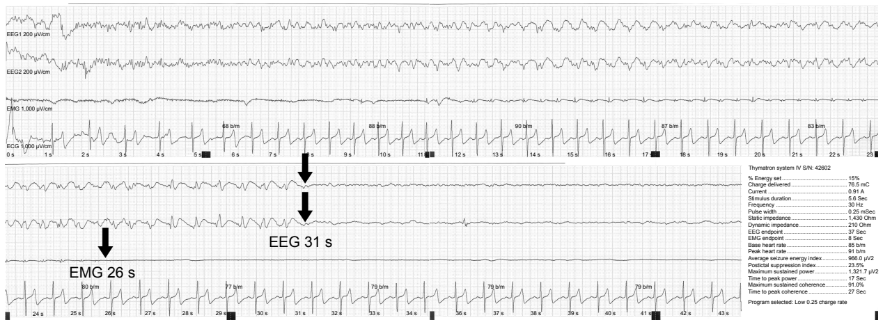
Figure 2 Successful seizure induction following the third stimulation of the eleventh session (right unilateral ultrabrief pulse ECT, Low 0.25, 15%), in which a tonic-clonic motor seizure was first observed.

Notes: EEG in channels 1 and 2, EMG in channel 3, and ECG in channel 4. The standard frontostastoid EEG electrode placements were used. The gain of the EEG amplifiers was set at 200 µV/cm, and the gain of the EMG and ECG amplifiers was set at 1,000 µV/cm.