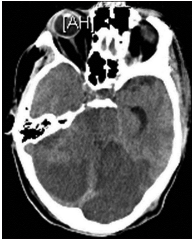
Figure 1: Bilateral cerebellar hemispheric and brainstem infarction

wounding mechanism. [4] The most common mechanism of penetrating injury is gunshot wounds, followed by stab wounds. Firearms are responsible for approximately 44%, stab wounds for approximately 40%, shotguns for approximately 4%, and other weapons for approximately 12% of all penetrating neck injuries. [3] Gunshot wounds were 3 times more likely to cause a large hematoma than stab wounds (20.6% vs. 6.7%), 2 times as likely to be associated with hypotension on admission (13.4% vs. 7.9%), 2 times as likely to result in a vascular injury (26.8% vs. 14.6%), and 13 times as likely to cause spinal cord injury (13.4% vs. 1.1%).