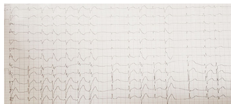
FIGURE 1: Male patient's ECG, ventricular arrhythmia (run of VT).

Abdominal pain and its symptoms appeared after drinking medicinal herbs. The abdomen was soft without tenderness and rebound tenderness. Gastrointestinal consultation showed no abnormality. The patient had a blood pressure of 80/50 and a heart rate of 115 beats per minute (bpm). The lung and heart sounds were normal and the pulse of the distal organs was full and symmetrical. The patient was also evaluated for myocardial infarction (MI), and the troponin test was negative. An irregular heartbeat was observed in the patient's ECG and cardiac monitoring (Figure 1). Ventricular arrhythmia (an automatic focus, monomorphic, variable cycle length, and nonsustained VT) with a stable hemodynamic state was diagnosed. Oxygen therapy and antiarrhythmic treatment were prescribed in the emergency department. 150 mg amiodarone was used to control the patient's arrhythmia. The patient was referred to the Coronary Care Unit (CCU) for further evaluation. He was hospitalized in the CCU for 48 hours, evaluated for any arrhythmia, and received cardiac medication. One mg/min amiodarone was used to control the patient's arrhythmia for 6 hours, and then, 0.5 mg/min amiodarone was used for 18 hours. The probabilities of cardiomyopathy as well as toxicity were rejected. Finally, the patient was discharged after 72 hours after taking the necessary examinations.