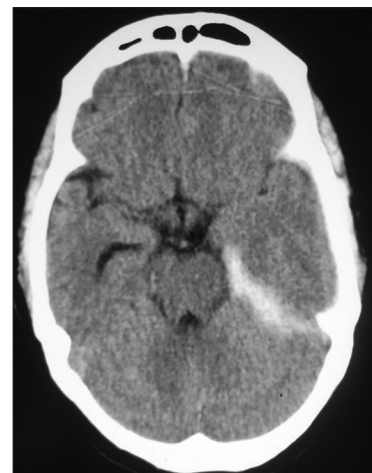
Figure 3: Computed tomography brain after the surgery suggestive of pachymeningitis