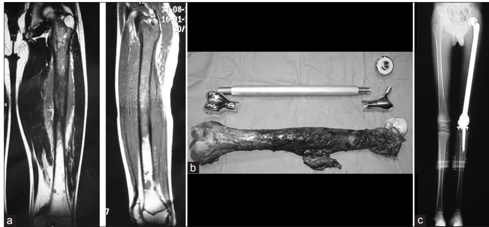
Figure 1: (a) Preoperative T1-weighted MRI showing involvement of the entire femur in a case of Ewing's sarcoma. (b) Intraoperative confirmation of prosthesis length compared to the resected specimen. (c) Radiograph demonstrating restoration of limb length after total femur prosthesis

infection and a hip disarticulation was finally performed (case 1).