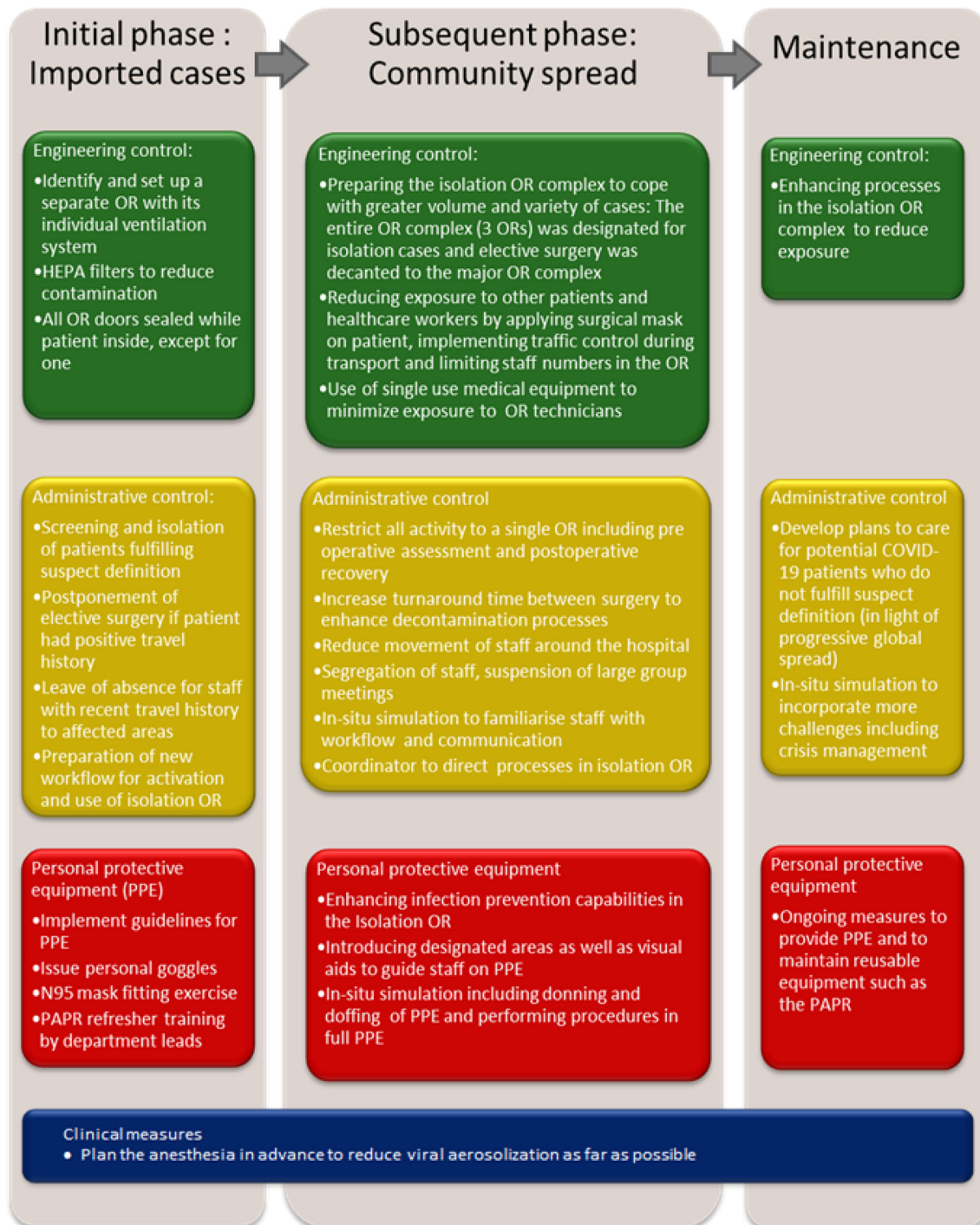
Fig. 6 Summary of the measures implemented in the operating room and anesthetic department to enhance infection prevention in a COVID-19 pandemic

should be used as ORs for surgical patients who had airborne infections. 28 Nevertheless, in our institution, all the ORs are positive pressure rooms and we did not have AIIR which could be used as ORs. Therefore, a separate OR complex was set aside for surgery involving COVID-19 patients. Disposable anesthetic and surgical equipment