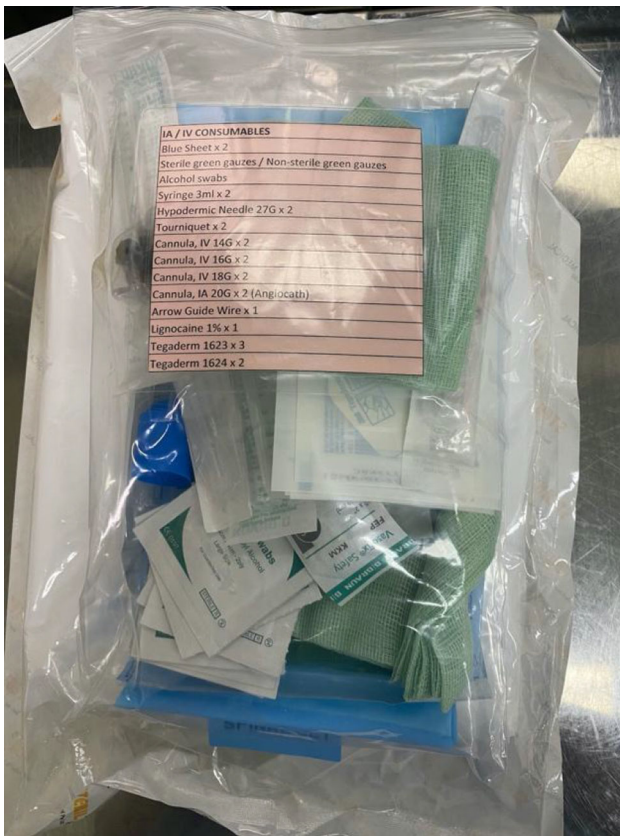
Fig. 4 Pre-packed sets of equipment

problems that were not apparent in the initial planning, such as lack of oversight and coordination, environment limitations, unsatisfactory equipment set-up, communication difficulties, lack of familiarity with protective equipment, infection control breaches, and inadequate support during crisis. These led to many downstream interventions, including appointing an OR coordinator to oversee this multi-step and multidisciplinary activation process to ensure that essential steps that may