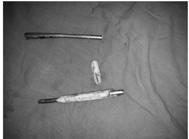
Figure 2. Sequestrum over a nail.

Infected non-union of long bones presents a challenge to the treating doctor. Most fractures fail to achieve union as a result of damage from initial injury and mechanical instability, which are further compounded by osteomyelitis, bone loss, multiple surgical procedures, disuse osteoporosis, soft-tissue atrophy, decreased arterial blood flow, and impaired venous and lymphatic drainage [17]. Management of these difficult non-unions can be described as limb salvage. The basis of managing an infected non-union is debridement of infected tissues and filling the gap thus created. Bone defect created after debridement of infected necrotic bone can be either filled by vascularised bone graft/simple bone grafting or by osteosynthesis. Vascularised bone graft from fibula or iliac crest can be used but only 40% patients united by such technique in the presence of infection [18]. Autogenous bone graft is limited by availability and cancellous bone takes years to fully corticalise in the presence of infection [19]. Ilizarov distraction osteosynthesis allows resection of the infected bone area,