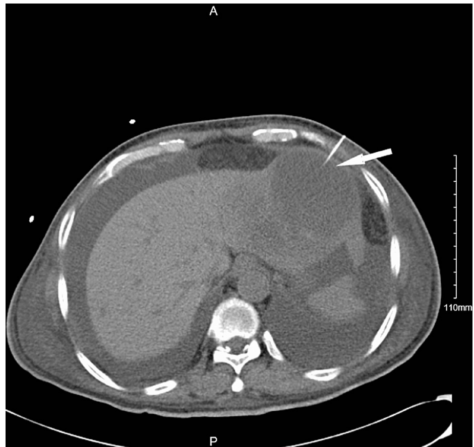
FIGURE 3: Computed tomography (CT) guided aspiration of hepatic cyst (arrow).

The culture of the drainage fluid as well as blood cultures collected on admission were positive for K. pneumoniae . The Ophthalmology department was consulted as well in view of reported visual disturbances in the setting of newly diagnosed uncontrolled diabetes to evaluate for retinopathy, and to rule out endophthalmitis. An ophthalmologic exam was negative for endophthalmitis; however, it showed multiple cotton wool spots secondary to septic emboli on the bilateral eyes with foveal sparing.