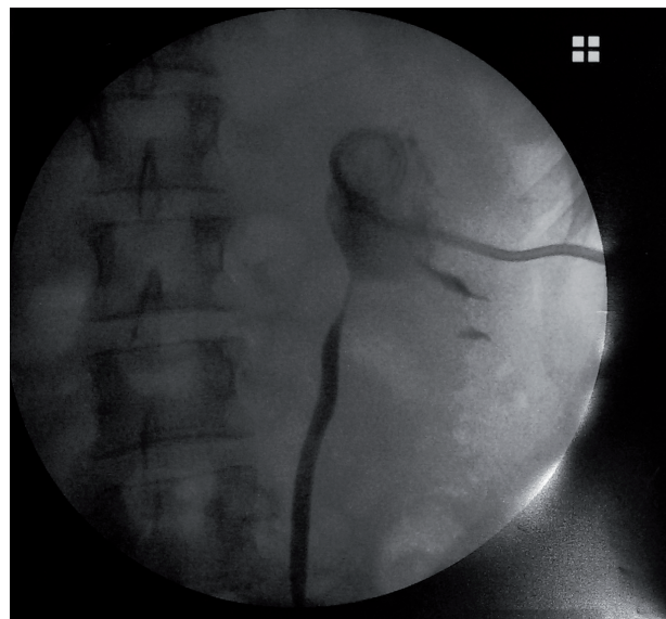
Figure 1 - Shows a recurrent UPJO (ureteropelvic junction obstruction) with a percutaneous nephrostomic tube.

Treatment success was evaluated by 12 months postoperative DTPA (diethylene-triamine-pentaacetate) renal scan, hydronephrosis and flank pain. Total success was defined as T_{1/2} \leq 10 minutes while relative success was defined as T_{1/2} between 10 to 20 minutes (9). All patients underwent a periodical clinical and radiological follow-up. All data were collected in a prospectively maintained database and retrospectively analyzed. Descriptive statistics of categorical variables focused on frequencies and proportions. Means and standard deviation were reported for continuously coded variables.