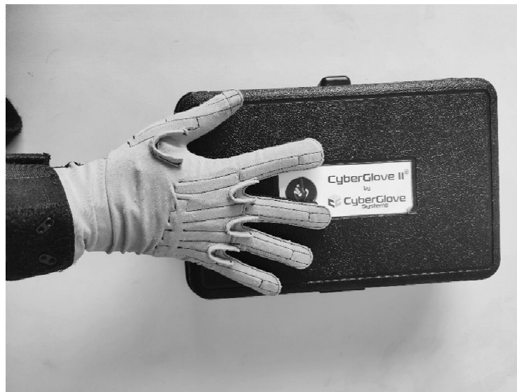
Figure 1. A participant wearing the CyberGlove II®.

Similarly, the total arc of motion (aROM) was defined as the range of flexion and extension angles that compose the ROM. Finally, the range of motion for each finger joint in each subtest (sROM) was calculated. The sROM was defined as the average of the extension and flexion angles corresponding to the activities of the subtest considered.