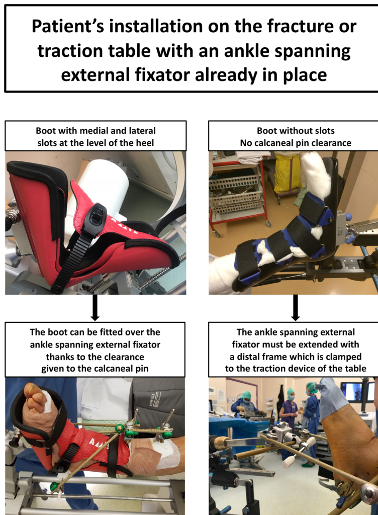
Fig. 1 Modified version of the poster used in the authors' institution as a technical reminder. This version was translated into English from the original version, and institutional markings were removed. On the left side, example of the AMIS Mobile Leg Positioner boot (Medacta International SA, Castel San Pietro, Switzerland): the boot has medial and lateral slots allowing proper fitting of the patient's distal leg into the boot, despite the presence of a tibio-cacaneal external fixator with a transcalcaneal pin. On the right side, example of the boot used with the operating table TruSystem™ 7500 with extension unit (Trumpf Medical, Saalfeld, Germany): the boot has no medial or lateral slot and the external fixator construct must be extended with a distal frame (Hoffmann III, Stryker, Selzach, Switzerland) which can be inserted and clamped into the fixation apparatus dedicated to the attachment of the boot

In order to address this situation, the authors describe a simple technique allowing rigid fixation of the limb with an ankle spanning external fixator to the traction device of the fracture or traction table, providing accurate control of the position of the lower limb in all planes for adequate fracture fixation or THA implantation. The technique is exemplified with a clinical case.