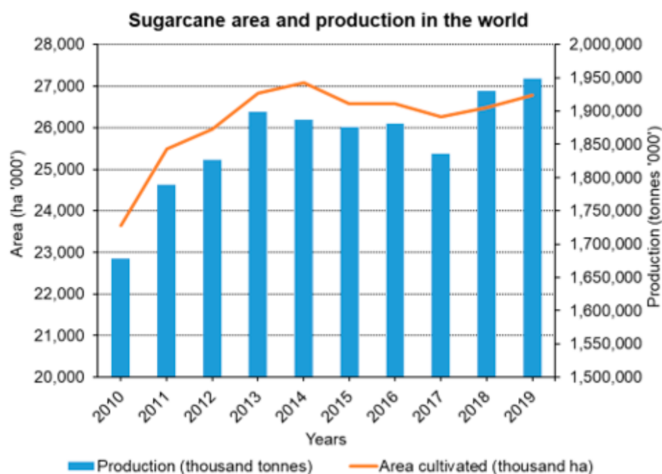
Figure 1. Worldwide sugarcane acreage and production from 2010 to 2019 (FAOSTAT, 2021).

The whip smut caused by Sporisorium scitamineum (Phylum: Basidiomycota, Order: Ustilaginales) is considered as the most serious and widely spread disease of sugarcane, known to affect both qualitative and quantitative components causing the substantial economic losses [9–15]. The severity of the disease often depends on the pathogen races, environmental conditions and cultivars grown [16,17]. It becomes more serious under favorable conditions, which can even cause a complete crop failure in extreme cases [18]. Besides the direct yield loss, the whip smut can cause the significant reduction in sucrose content, purity and other juice quality indicators [19–21]. Different races of S. scitamineum are known to exist. Random amplification of polymorphic DNA (RAPD), sequence-related amplified polymorphism (SRAP) [22], amplified fragment length polymorphism (AFLP) [23] and internal transcribed spacer (ITS) sequence analysis [24,25] have been applied to evaluate the intraspecific diversity among the S. scitamineum populations.