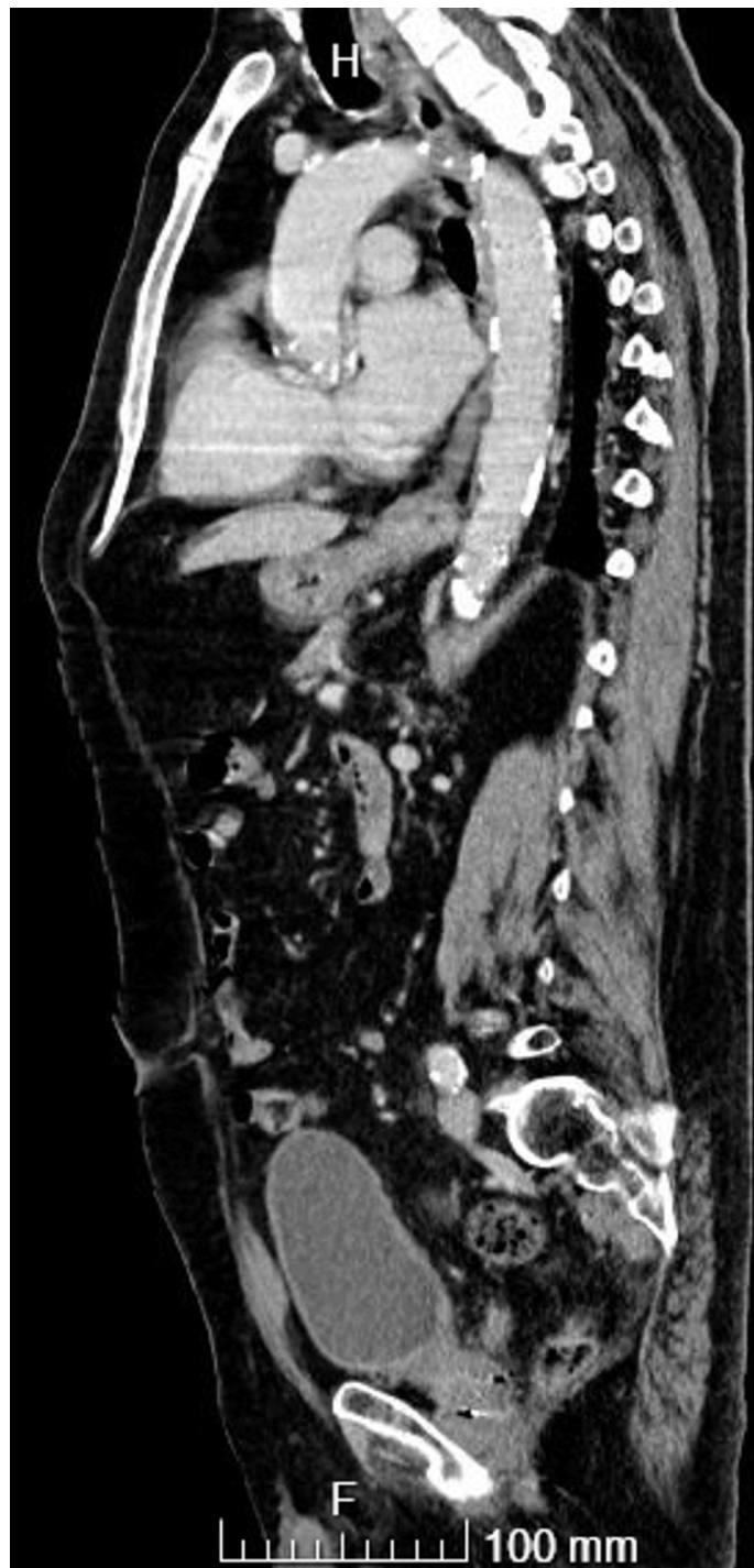
FIGURE 1: Thoracoabdominal-pelvic CT: calcified atheromatosis of the entire aorta.

The patient was readmitted after one month due to the same symptoms as previously associated with arthritis of the hands (metacarpophalangeal [MCP] and wrists) and knee without synovitis palpable. During hospitalization, the patient manifested migratory arthralgia. A physical examination, showed no oral ulcers, cutaneous and urogenital lesions, but revealed a systolic murmur, afternoon febrile peaks with a maximum temperature of 38.7°C, normotensive with no differences in measurement between the limbs; a neurological examination and ophthalmological evaluation were normal. A transesophageal echocardiography (TEE) (Figure 2) was conducted, revealing the presence of multiple complex atherosclerotic plaques with associated thrombi in all segments of the aorta with a vegetating mass of erratic movements that did not allow the exclusion of aortic vegetation (7x1.5mm) in the transition of the aortic arch and descending aorta, while an MRI showed aortic thickening and calcified atheromatosis of the thoracic, abdominal aorta and aortic branches, including visceral branches and supra-aortic trunks. Aortitis was identified based on CT,