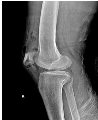
Figure 3: Technique of patellar tendon repair with bone tunnel, (a) and (b). Post-operative lateral radiography of Lt and Rt knees showing patella in normal position, (c) and (d)

First, the tourniquet on the left lower extremity was activated under pressure of 350 mm Hg and a 15cm long incision was made in the anterior knee. After removing subcutaneous tissues, the quadriceps tendon and patella