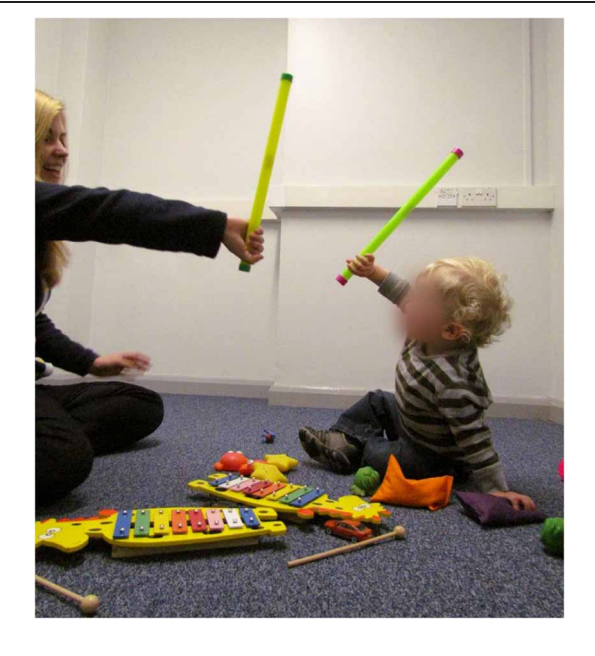
FIGURE 4 | Interventions targeting synchronous motor activity. Child and therapist engaged in Reciprocal Imitation Training (RIT). RIT involves the therapist imitating the child's actions and gestures, and also modeling developmentally-appropriate actions and gestures for the child to imitate, in a play context. The child is encouraged and prompted to imitate, until regular spontaneous reciprocal imitation is established.