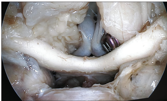
Figure 3: Exposure of anterior communicating artery, distal segments of the proximal anterior cerebral arteries, proximal segments of the distal anterior cerebral arteries, and clipping of the distal segment of the left proximal anterior cerebral artery was performed