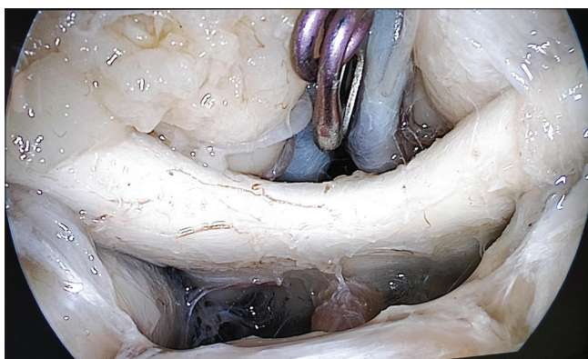
Figure 4: Clipping of the anterior communicating artery was performed and the structures after clipping

in the present study, clip placement was possible in all subjects for the superior, anterior, and inferior surfaces. An anterosuperiorly projecting aneurysm dome would offer the most favorable access for endonasal clip application, best visualization of the aneurysm neck as well as perforators,