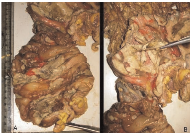
Figure 2. (A) Cecal area; and (B). Hepatic flexure of resected colon, showing large ulcers covered with plaques of yellowish necrotic material, appendices is pointed by forceps.

negative. Urine sample was also sent for routine microscopy which showed few pus cells and presence of E. coli . Abdominal radiograph in erect position showed dilated bowel loops but no free air under the diaphragm. Ultrasonography of abdomen was asked for, which