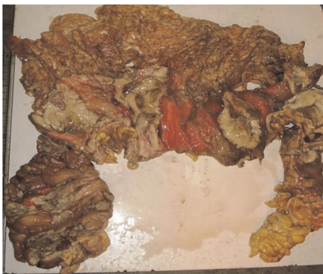
Figure 1. Total colectomy specimen (Opened), showing multiple large geographic ulcers covered with necrotic purulent slough.

diarrhea for last eight months. Before coming to our institute he was diagnosed as a case of inflammatory bowel disease and was being treated with acetyl-salicylic acid (Mesacol 800 mg TDS) and intermittent steroid therapy for eight months. He was a chronic alcoholic and smoker. On examination, patient looked toxic with pulse rate of 126/minute. Tenderness and guarding was present all over abdomen. Blood samples were immediately sent for routine investigations, which were significant for the presence of leucocytosis (18,300/cmm), Na + 129 mEq/l and K + 2.9 mEq/l. ELISA test for HIV detection was