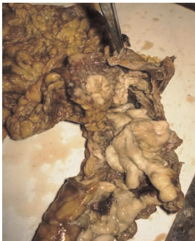
Figure 3. Splenic flexure of resected colon; large necrotic area with perforation has been shown.

diarrhea for last eight months. Before coming to our institute he was diagnosed as a case of inflammatory bowel disease and was being treated with acetyl-salicylic acid (Mesacol 800 mg TDS) and intermittent steroid therapy for eight months. He was a chronic alcoholic and smoker. On examination, patient looked toxic with pulse rate of 126/minute. Tenderness and guarding was present all over abdomen. Blood samples were immediately sent for routine investigations, which were significant for the presence of leucocytosis (18,300/cmm), Na + 129 mEq/l and K + 2.9 mEq/l. ELISA test for HIV detection was