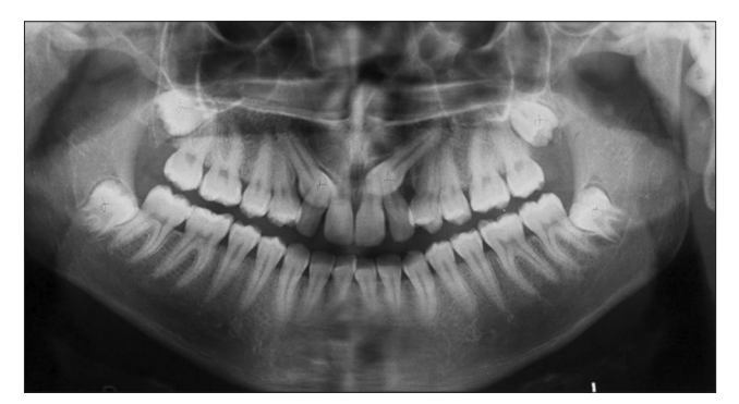
Figure 5: Pretreatment OPG of the patient

Tongue appliance 9,10 and jack screw mounted in the midline were used for 6 months in order to advance the maxilla and correct the posterior crossbite. The patient was instructed to open the screw of the palatal expansion 1/4 of a turn per week for 6 months. A tightly fitting and well-retained upper removable appliance was fabricated with Adams clasps on the upper first permanent molars and two C clasps were placed on the upper permanent central and lateral incisors. Long tongue cribs were placed in the palatal area between canine to canine. These cribs were long enough to cage the tongue and were adjusted to avoid traumatizing the floor of the mouth. After 6 months of wearing the tongue appliance, the occlusion was improved; afterward, the lower first premolars were extracted and the patient was banded and bonded with 0.22 standard edgewise appliance in