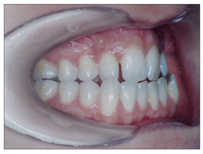
Figure 2: Pretreatment intraoral photos of the patient