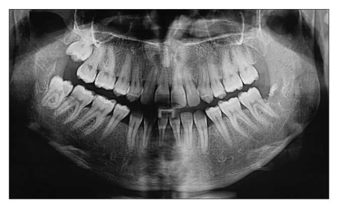
Figure 12: Post-treatment OPG of the patient