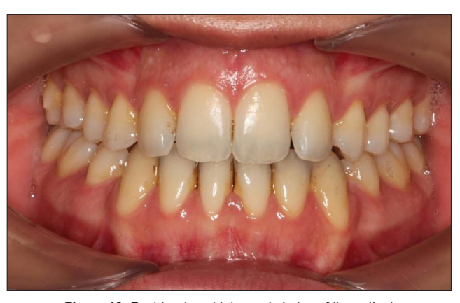
Figure 10: Post-treatment intra-oral photos of the patient

The present case is about an adult patient with class III malocclusion due to maxillary deficiency. The age of