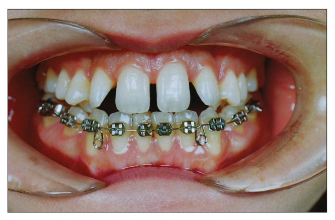
Figure 7: Improvement after tongue appliance

the lower arch [Figure 7]. At the same time, reverse chin cup<sup>[21]</sup> was added in order to reinforce the process of bone remodeling in the nasomaxillary complex. Tongue appliance combined with reverse chin cup was used for 6 more months. Afterwards, the reverse chin cup was removed and the treatment was continued with the tongue appliance combined with 0.22 standard edgewise appliance in the upper arch for 1 year [Figure 8].