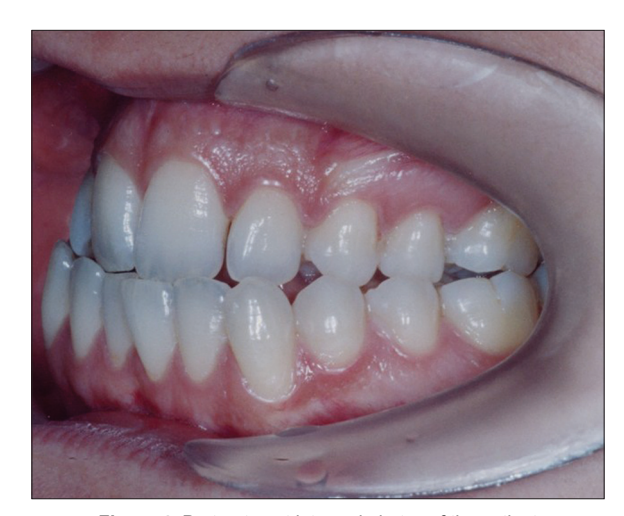
Figure 4: Pretreatment intraoral photos of the patient