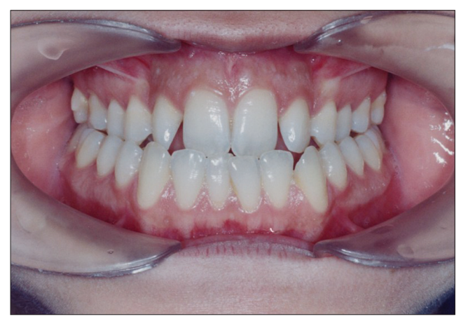
Figure 3: Pretreatment intraoral photos of the patient