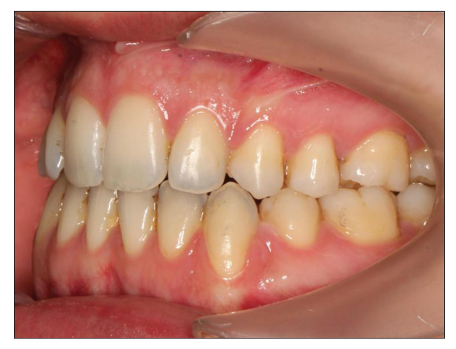
Figure 11: Post-treatment intra-oral photos of the patient