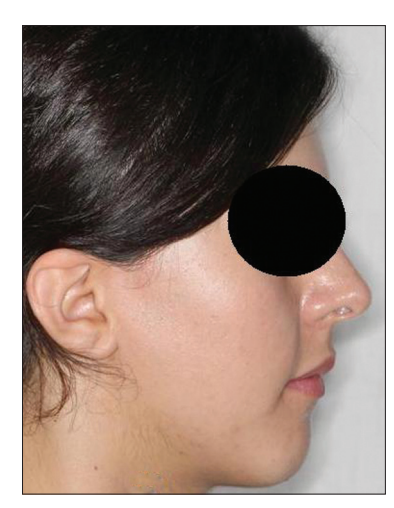
Figure 9: Post-treatment profile view of the patient