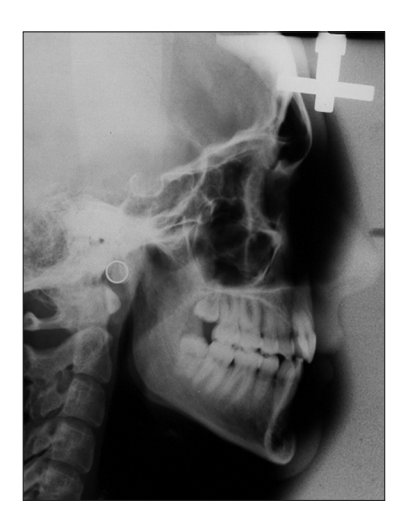
Figure 13: Post-treatment lateral Cephalogram of the patient