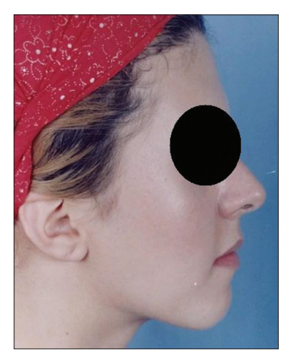
Figure 1: Pretreatment profile view of the patient

Intraoral examination showed anterior and posterior crossbites and reverse overjet. The molars showed class I relationship; however, they had class III relationship due to the loss of upper left and right canines. Loss of upper left and right canines resulted in mesial migration of upper molars; thus, the relationship of molars changes from class III to class I malocclusion [Figures 2–4]. Cephalometric analysis confirmed skeletal class III and vertical growth pattern with maxillary deficiency [Table 1] [Figures 5 and 6].