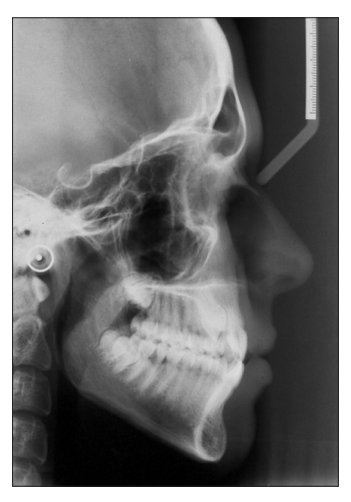
Figure 6: Pretreatment lateral Cephalogram of the patient

Positive overjet and overbite were achieved after 24 months of active treatment [Figures 9–11]. The post-treatment cephalometric radiograph tracing showed favorable increase of 3° and 2° in the Sella, Nasion, A point (SNA) and A point, Nasion, B point (ANB) angles [Table 1, Figures 12 and 13]. Nasolabial angle was improved and ideal overjet and overbite were achieved. The superimposition of pre and post-treatment cephalometric tracing on the anterior cranial base is shown in Figure 14.