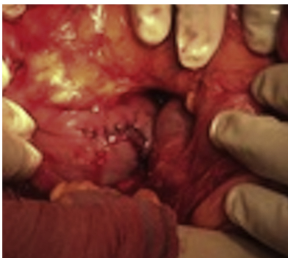
Fig. 2. Repair of the duodenotomy with interrupted sutures.

ach without clear source of active bleeding being found. He received transfusion of 3 units of red blood cells (RBC). Patients' condition was worsening, he lost consciousness hence the EGD was repeated. In the third portion of duodenum a submucous, actively bleeding tumor was found. Endoscopic hemostasis was unsuccessful and patient was in haemorrhagic shock. He was transferred in the operating room for an emergency explorative laparotomy. Procedure was performed by two experienced abdominal surgeons (more than 10 years experience in abdominal surgery; one of the surgeons has title of university professor). After extensive mobilization of the duodenum a 2 × 2 cm intraluminal tumor with central bleeding was found in the third portion of the duodenum (Fig. 1). The diseased part of the duodenum was excised (Fig. 2) and the duodenotomy was closed with interrupted sutures (Fig. 3). During surgical procedure he received 8 units of RBC, 4 units of FFP (fresh frozen plasma) and 1 unit of concentrated thrombocytes. Postoperative period was uneventful, only small inflammation of the laparotomy was present which was cured with conservative measures. Hb level was stable. Patient was discharged on the 9th postoperative day. Pathologist reported spindle cell GIST, without mitosis, low grade, pT1 R0. Patient was discussed at the multidisciplinary team meeting (MDT) which decided that only a regular follow-up was indicated.