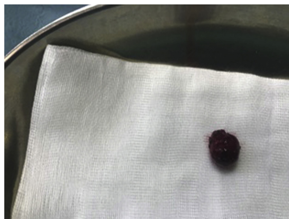
Fig. 3. Tumor after excision.

ach without clear source of active bleeding being found. He received transfusion of 3 units of red blood cells (RBC). Patients' condition was worsening, he lost consciousness hence the EGD was repeated. In the third portion of duodenum a submucous, actively bleeding tumor was found. Endoscopic hemostasis was unsuccessful and patient was in haemorrhagic shock. He was transferred in the operating room for an emergency explorative laparotomy. Procedure was performed by two experienced abdominal surgeons (more than 10 years experience in abdominal surgery; one of the surgeons has title of university professor). After extensive mobilization of the duodenum a 2 × 2 cm intraluminal tumor with central bleeding was found in the third portion of the duodenum (Fig. 1). The diseased part of the duodenum was excised (Fig. 2) and the duodenotomy was closed with interrupted sutures (Fig. 3). During surgical procedure he received 8 units of RBC, 4 units of FFP (fresh frozen plasma) and 1 unit of concentrated thrombocytes. Postoperative period was uneventful, only small inflammation of the laparotomy was present which was cured with conservative measures. Hb level was stable. Patient was discharged on the 9th postoperative day. Pathologist reported spindle cell GIST, without mitosis, low grade, pT1 R0. Patient was discussed at the multidisciplinary team meeting (MDT) which decided that only a regular follow-up was indicated.