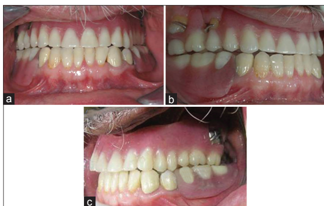
Figure 4: Final finished and polished overlay removable partial dentures (a) and during latrusive movements (b and c)

ORPD. The existence of maxillary right second molar and premolar had a positive impact for providing precise CR record. The record transferred to the articulator, and the occlusal plane was aligned and adjusted. The acrylic tooth mounted in the modeling wax (Dentsply, Hoorn, England), and try-in dentures were formed. In the following visit, occlusal interferences were eliminated, and try-in dentures were delivered to the laboratory for final acrylic (Meliodent Multicryl, Heraeus-Kulzer, GmbH, Wehrheim, Germany) processing.