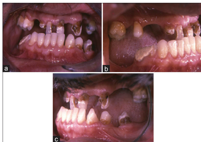
Figure 1: Intraoral examinations of patient in frontal (a), right side (b), and left side views (c)