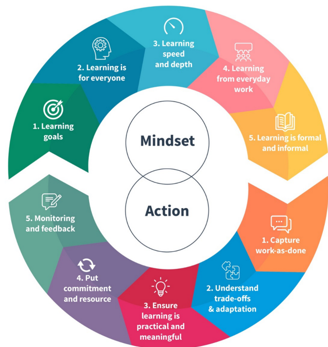
Figure 1 The CIEHF framework for organizational learning.

The pressure on healthcare organizations has led to the rapid adoption of containment measures largely based on imitation of compliant behaviours immediately embedded into the routine activity. The impact of COVID-19 on elective surgery set a benchmark during the ‘acute phase’ useful to manage the ‘transition phase’ [32].