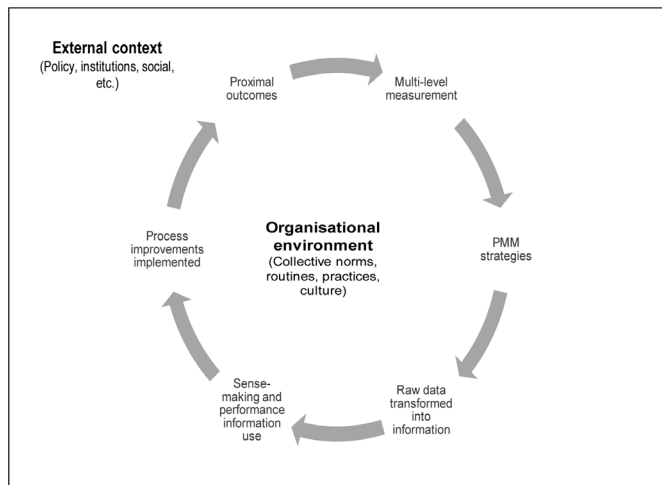
Figure 1 Performance measurement and management (PMM) framework.

performance of individual providers, organisations and entire health systems. 5