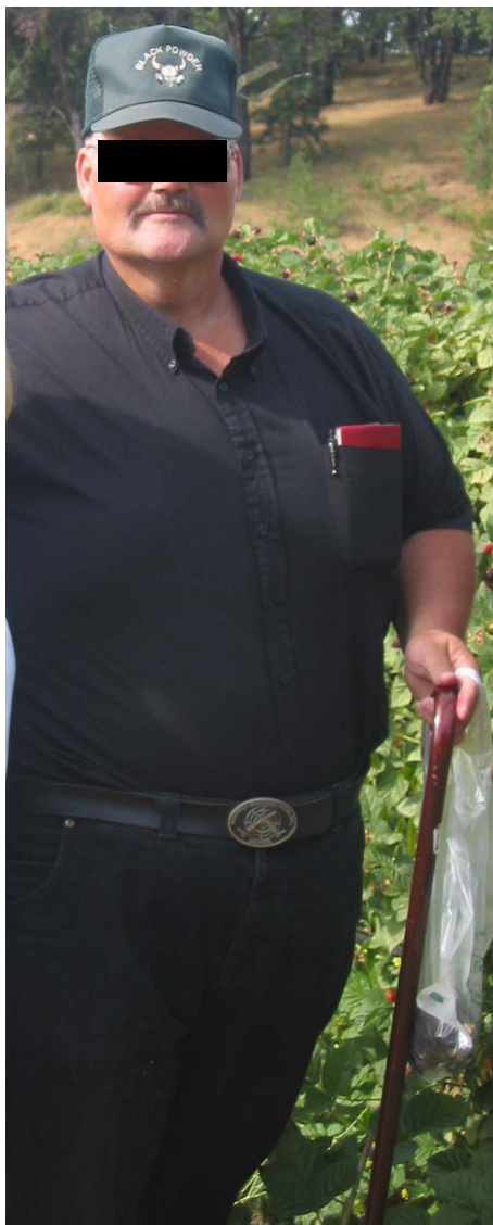
Figure 1. Patient's photograph.

The autopsy findings were remarkable for multiple architectural cortical abnormalities including bilateral abnormal gyration or gyri crowding; mild enlargement of the left lateral ventricle; broad thinning of the cortex, more prominent in rostral cortex (3 mm); thin corpus callosum, mainly at its posterior level (0.4–0.5 mm); and