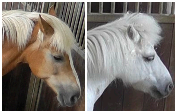
Figure 1. Example of pictures scored by the students.

Twenty previously scored pictures showing a profile view of the head of different breeds and colours of horses were selected (for an example see Figure 1). The pictures provided were collected from horses in pain due to acute laminitis (previously published data on the HGS [11]). High-quality pictures were selected with the aim of showing a wide range of FAU scores (balancing the number of pictures with scores of 0, 1 and 2 for the different FAUs). Pictures were projected on a screen one at a time. Data were collected in two phases: pre- and post-training. In the 'pre-training' phase students first received a brief lecture on the definition of pain and its effect on facial expressions in different species (e.g., mice, rats, rabbits) but not horses. They then were asked to score 10 pictures of horse faces. They were not introduced to the HGS in this phase. In the 'post-training' phase students received the HGS standardized training outlined in Section 2.2 and then scored a second different set of 10 pictures. All pictures were also scored by an HGS expert (E.D.C.).