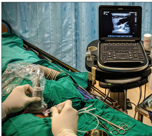
Figure 1: Ultrasound-guided right internal jugular vein central venous catheter insertion in a patient

USG: Ultrasonography, AL: Anatomical landmark