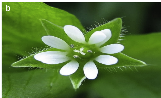
Figure 1. Images of different parts of Stellaria media ([a] whole plant [b] aerial part (flower)).