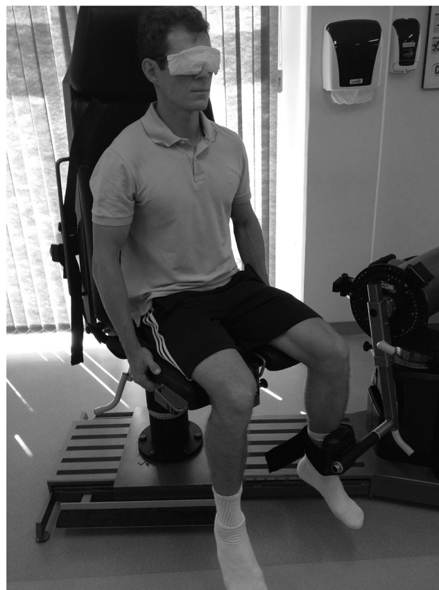
Fig. 1 – Subject positioned in the isokinetic dynamometer to perform the joint position reproduction test (sensing of position).

The individual error value for each attempt made was determined through the difference between the position reproduced and the position experienced. The proprioceptive performance was determined by means of the values of the absolute error (AE), variable error (VE) and constant error (CE).