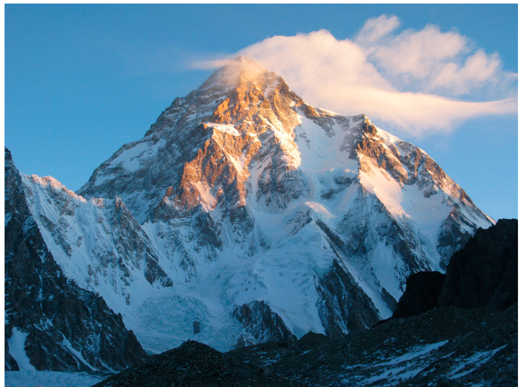
Figure 1. K2 in Karakoram, photo from a Polish winter expedition.