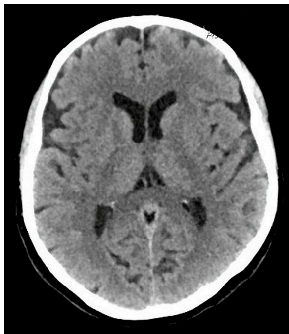
Figure 3. The computed tomography of the patient’s head did not reveal any abnormalities responsible for his symptoms.

The porter consulted a doctor from Poland via satellite links who recommended that he leave the expedition and accompany a passing trekking group downhill before going to a hospital in Islamabad. There, funduscopy with ophthalmological consultation, electrocardiography, echocardiography, routine electroencephalography and blood tests (a full blood count, erythrocyte sedimentation rate, platelets, creatinine, blood urea nitrogen, glucose, electrolytes, transaminases, lipids and coagulation profile) were conducted. None of these diagnosed any significant abnormalities. The computed tomography of his head (Figure 3) with angiography revealed no infarction, intracranial hemorrhage or mass lesion; the arterial and venous vasculature appeared normal, with no stenosis. No pathologies were found in the carotid and vertebral Doppler ultrasonography. The neurological examination was unremarkable. The patient consulted several experts in altitude medicine and neurology from the Department of Adult Neurology of the Medical University of Gdańsk (Poland), the Institute for Altitude Medicine in Ridgway (United States) and the Centre for Mountain and Neurology Medicine in Aosta Valley (Italy).