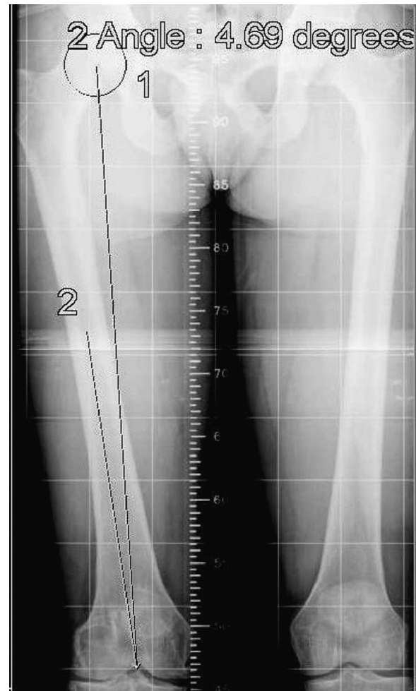
Fig. 1 – Magnification of the femur on a panoramic radiograph on the lower limbs showing the angle of the distal femoral resection determined by the intersection of the femoral mechanical axis (FMA) and the femoral anatomical axis (FAA).

The axes were traced out using a ruler and the angles were measured using a protractor (Desetec® for both instruments), graduated in 0.1 mm and 0.5° divisions. All the measurements