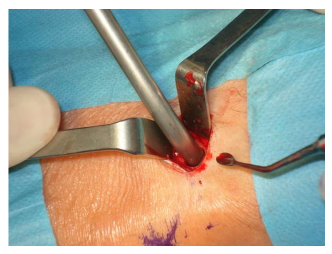
Figure 3. A bone collector attached to the vacuum suction is used to collect the bone.

Having cut out the window in the cortical bone with a trephine, no attempts of direct harvesting of the cancellous bone were made. Instead, the cancellous bone was separated from the cortical layer with straight and curved curettes. A commercially available bone collector (Bone Vac produced by Stryker, Portage, MI, USA) attached to the vacuum suction was used to collect the bone (Figure 3). During the cancellous bone collection, copious irrigation with 0.9% sterile saline solution was performed. The procedure was carried out until there was no more cancellous bone available or retrievable through the bony window. The cortical bone taken out during the window opening was particulated in a bone mill (SD-Bone Mill produced by Surgident Co. Ltd., Dong-gu, South Korea), mixed with the cancellous bone retrieved from the proximal tibia, and used for the grafting procedure.