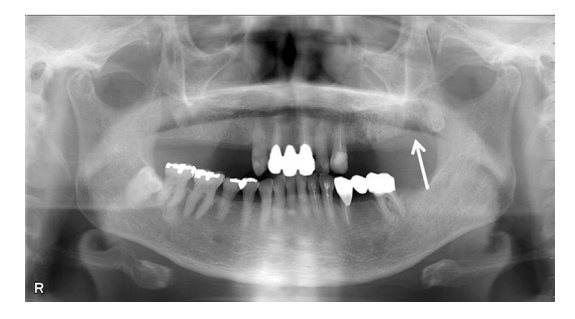
Fig. 2. Dental panoramic radiograph after extraction of 2nd M (focus of infection) as well as 1st and 2nd premolars in upper left jaw reveals the occurrence of osteonecrosis of the jaw surrounded by osteosclerotic bone (white arrow).

risk:benefit ratio. Brown et al. [77] described that ONJ and atypical fractures might be related to the use of BPs in osteoporosis, but they are exceedingly rare and they often occur with other comorbidities or concomitant medication use. Additionally, there is little clinical evidence that temporary discontinuation of BPs helps to prevent the occurrence of BRONJ resulting from invasive dental treatments [78]. Based on the physicochemical properties of BPs that are deposited and persist in the bone for a long period of time, it appears unlikely that a temporary BP discontinuation would prevent BRONJ.