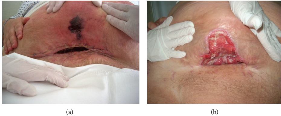
FIGURE 2: Wound healing on days 10 and 21 after surgery.

care she was discharged and instructed to return for wound treatment every day and self-administer 2 \times 200 mg heparin bid, and weekly measurement of heparin level was required. Anti-fX activity confirmed therapeutic level while on day 32 after surgery the value was only 0.2 suddenly. It turned out that patient self-administered heparin later (she fell asleep) and the usual heparin measurement occurred 2 hours after administration of the drug (Table 1). Wound treatment was applied until week 4 after surgery and heparin treatment was given for 2 months. Week 6 follow-up examination confirmed normal status aside from the extreme bodyweight of the patient (173 kg bw).