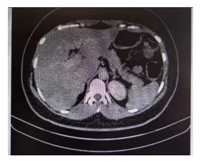
Figure 1. Multiple hypoattenuating foci of variable sizes are seen predominantly in the right hepatic lobe involving a large volume of the liver

suspicion of lesions other than hemangiomas in the present case. Biopsy and immunohistochemical staining were performed to distinguish the definite pathology of the lesions. Hematoxylin and eosin (H&E) staining of the specimen revealed epithelioid and histiocytoid cells in a dense fibrous stroma. Intranuclear pseudoinclusions (INPIs) were detected by H&E staining of the lesions. Immunohistochemically, the specimen was positive for cluster of differentiation (CD34) and negative for cytokeratin (CK) (Figures 2 and 3). Histological evaluation of the lesion revealed a rare EHE. The patient's whole-body scan result was unremarkable. She was primarily started on combination therapy with propranolol and prednisolone, which was not effective