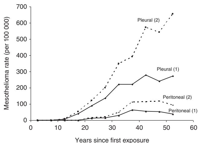
Figure 1 Observed pleural and peritoneal mesothelioma rates by time since first exposed (using Methods 1 and 2 for determining follow-up date).