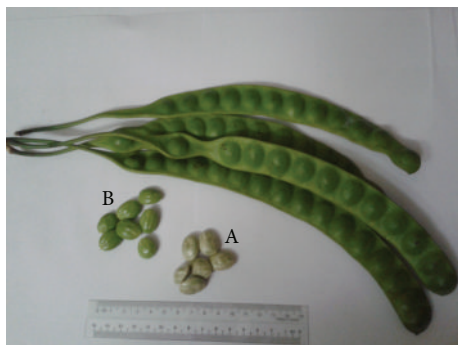
FIGURE 1: The pods and seeds with (grey, A) or without (green, B) seed coats of Parkia speciosa . The plant materials were collected from a plantation at Batang Kali, Selangor, Malaysia, in January 2013.

are present in the seeds. Phenolic compounds are also present in almost all parts of the plant. To date, not many studies have been done to elucidate the chemical properties in the pods. In the seeds, the terpenoids detected using gas chromatography were \beta -sitosterol, stigmasterol, lupeol, campesterol, and squalene [14, 15]. Interestingly, lupeol was found to possess anticarcinogenic [16], antinociceptive, and anti-inflammatory properties [17]. No flavonoid like quercetin, myricetin, luteolin, kaempferol, or apigenin was detected in the methanolic extract of P. speciosa seeds using a reversed-phase high performance liquid chromatography [18], but it was noted to be present in the ethanolic extract when screened using a colorimetric assay [10]. Besides, alkaloids and saponins were also found in the plant. The seeds also contain cyclic polysulfides, namely, hexathionine, tetrathiane, trithiolane, pentathiopane, pentathiocane, and tetrathiepane [19] which are responsible for its strong pungent smell and taste, while the presence of djenkolic acid in the seeds is thought to cause blockage of the ureter [20].