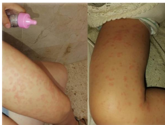
Figure 3. Girl aged 6-year-old with COVID-19 and with lower limb erythema (maculopapular rash with pruritus).

The second most frequent rash in patients with COVID-19 is urticaria, which is more frequent in women (66%) of an average age (47.6 years). Urticaria is the presence of raised, reddish wheals that are often pruritic and appear in different circumstances, and may even be idiopathic [13]. The highest number of cases was reported in Spain, occurring mainly during the active phase of the infection [11]. Erythema pernio is the oedematisation of the smaller blood vessels that innervate the skin, resulting from vasoconstriction and hypoxaemia caused by prolonged exposure to cold and then to sudden heat. Footcare professionals should establish a differential diagnosis with Raynaud's syndrome, acrocyanosis, vasculitis, lupus erythematosus, livedo reticularis , and significant ascorbic acid deficiencies [14]. There is no consensus among authors regarding the manifestation of livedo reticularis , which is a rash characterised by a bluish-red mottling of the skin in the form of a web. There is an idiopathic form that particularly affects the legs, thighs, and buttocks, which is accentuated by cold and is more common among women under 40 years of age [14].