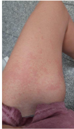
Figure 1. Woman aged 33-year-old with COVID-19 and skin lesion (exanthema, urticarial, and maculopapular lesions) on left lower limb.

Previous studies have described the clinical and dermatological manifestations in the feet, the most frequent being oedema, exanthema, erythema pernio (also called chilblains), ischaemia, distal necrosis, vesicles, maculopapules, papulosquamous lesions, urticaria, and recurrent herpes [9].