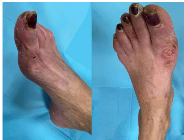
Figure 2. Woman aged 54-year-old with acral lesions caused by COVID-19 on both feet (blisters on the toes similar to perniosis).

Patchy acrocyanotic lesions have been sometimes described with blisters on the fingers and toes, similarly to perniosis and occurring in children and adolescents without other symptoms [10]. These apparently less-severe dermatological signs may be directly associated with the disease and are, therefore, of the utmost importance for healthcare professionals to detect, given that the incidence of dermatological signs of COVID-19 in December 2020 was between 0.2% and 29%, even in undiagnosed patients [8]; see Figure 2.