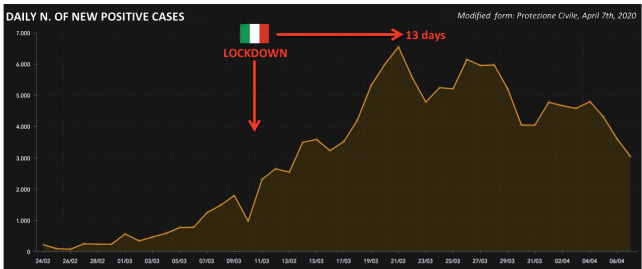
Figure 3. Trend of overall new notified cases in Italy (Protezione civile, 7,4,2020) 1

neighboring areas (Brescia and Piacenza) (5).