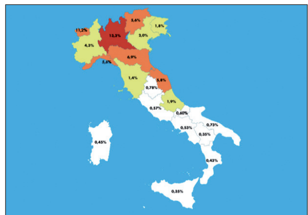
Figure 4. Estimate of Period Prevalence of infected people in the Italian regions as at 7 April, 2020

The post-epidemic phase might benefit from the availability of forthcoming antibody serological tests. The benefit could be substantial for a large part of the country population, but especially central and southern Italy, that would not yet be infected, as shown by our estimates.