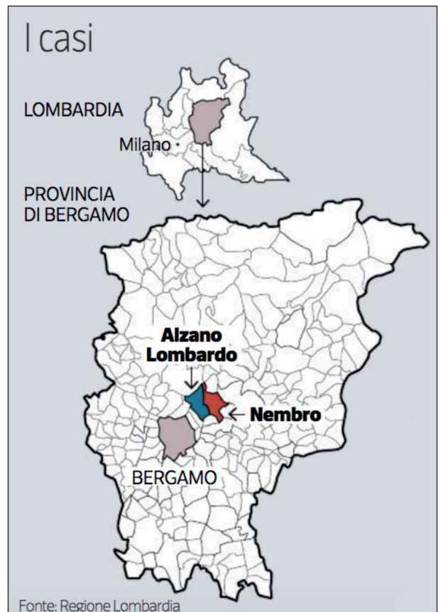
Figure 2. Missed “Red Zone” Area (March 3 rd )