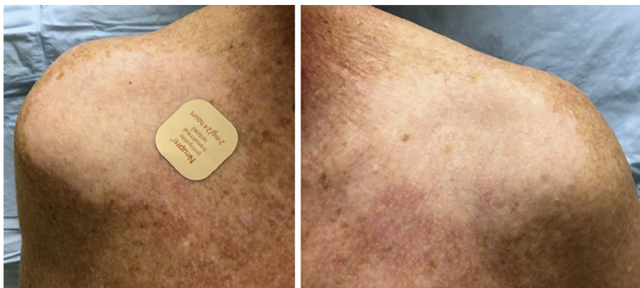
Fig. 1. Sharply demarcated depigmented patches on the bilateral anterior shoulders, where rotigotine patch was applied.

Physical exam showed sharply demarcated depigmented patches on the bilateral anterior shoulders (shown in Fig. 1). Wood's lamp exam showed bright fluorescence throughout most of the lesion with a thin border of dimmer fluorescence that merged into the unaffected surrounding skin. Lentigines were nearly absent as compared to the surrounding skin. No other lesions were noted, and no suspicious melanocytic lesions were identified on a complete mucocutaneous examination. Shave biopsy was performed on the left shoulder at the edge of