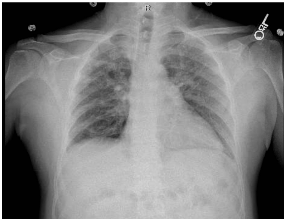
FIGURE 1: Chest x-ray posteroanterior (PA) view showing fibrosis and nodularity

A rheumatological evaluation ruled out any autoimmune diseases. CT of the chest and abdomen showed multiple bilateral multiple pulmonary nodules, both smaller and more significant. The largest was 2.1 cm with moderate bilateral pleural effusion, enlarged mediastinal lymph node (Figure 2).