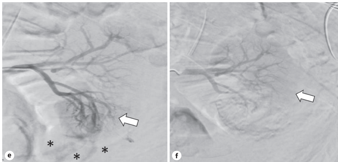
Fig. 2. e Pre-embolization arterial phase angiogram showing a hypervascular blush (arrow) in the right inferior renal pole with active contrast extravasation extending inferior to the kidney in multiple streams (asterisks). f Post-embolization arterial phase angiogram showing normal vascularization of the upper pole of the left kidney and hypovascularity of the lower pole (arrow) without active contrast extravasation.

abdominal imaging prior to starting anticoagulation is not commonly practiced. AML is a rare tumor, with a prevalence of 0.2–0.6% in the general adult population [13]. Hence, data on the number of bleeds from these occult tumors after starting anticoagulation is limited. Furthermore, there is no evidence on withholding anticoagulation even if an incidental AML is identified.