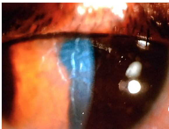
Fig. 1 Diffuse corneal edema and Descemet's folds in right eye

The patient was prescribed prednisolone acetate 1% ophthalmic suspension QID for both eyes. His vision subjectively recovered to his