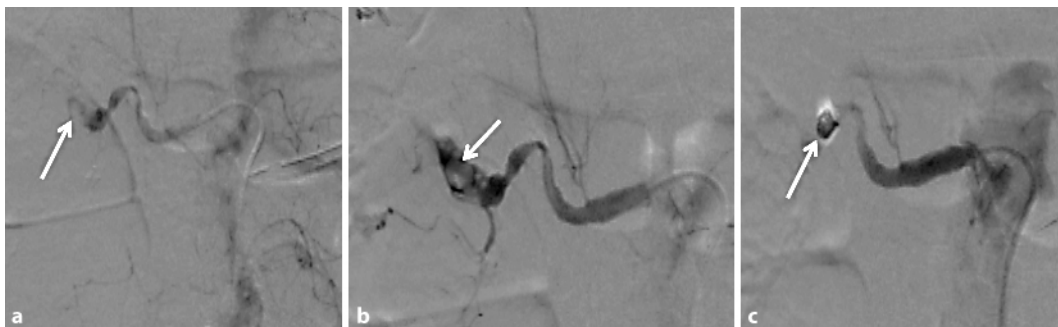
Fig. 2. a Leakage from the renal artery. b, c Gel film and coiling for hemostasis and arrest of bleeding.