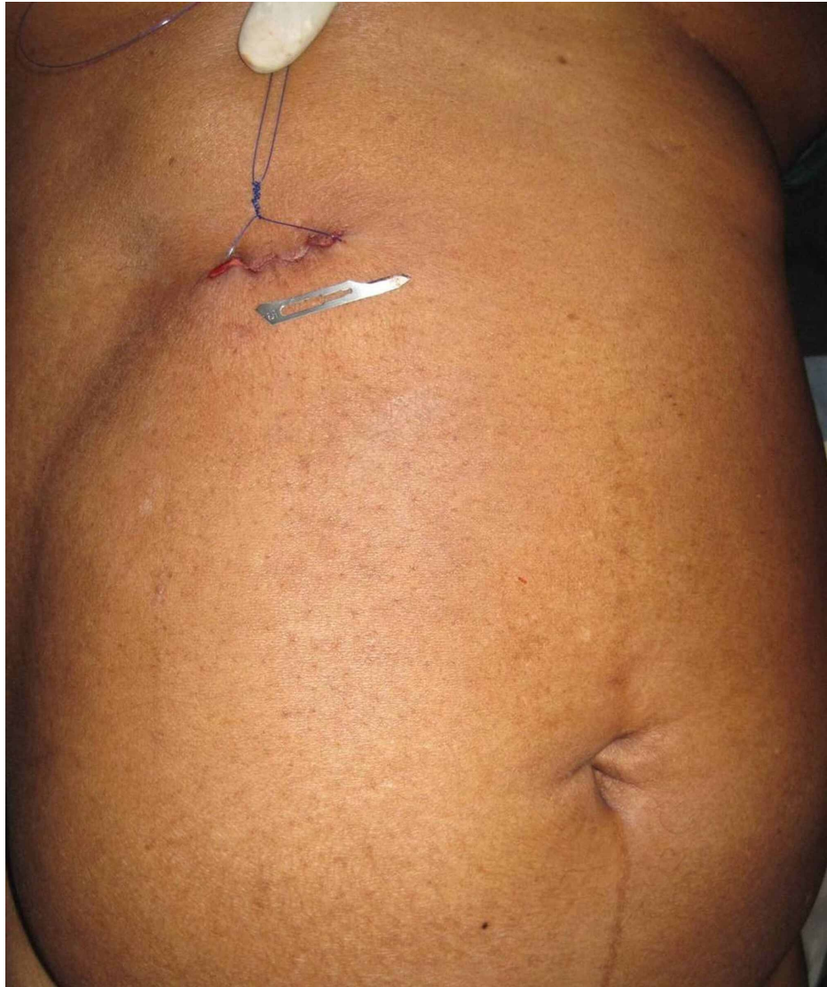
FIGURE 3: 4cm incision seen after closure of minilaparotomy cholecystectomy wound