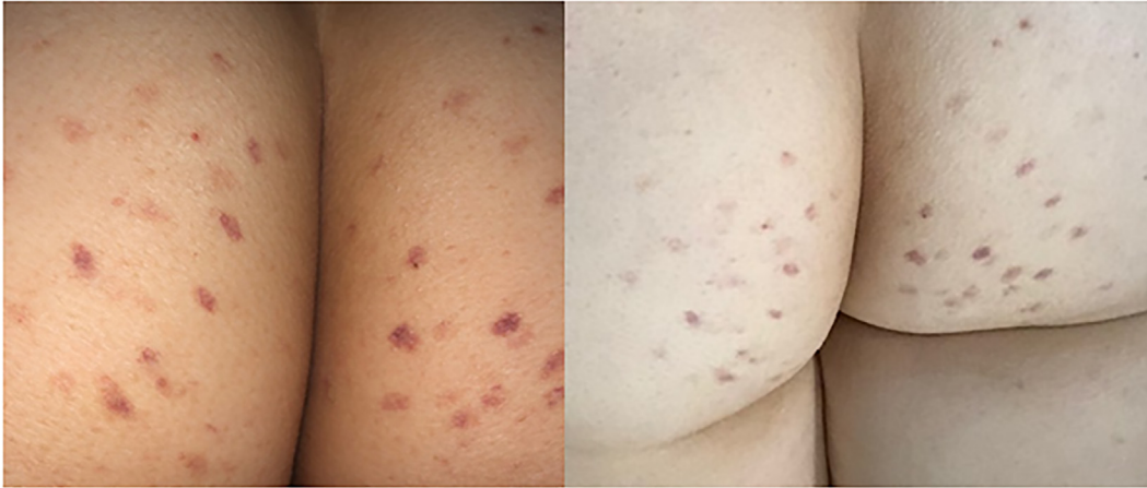
Fig. 1. Multiple purpuric lesions, some with darker centers. The rash was non-palpable, non-pruritic, non-blanching, and only localized to the gluteal region.