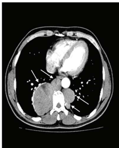
Figure 1. Multiple paraspinal masses (indicated with arrows) in case 1 in the rear mediastinum were observed, and the largest measured 6.2x8.0 cm.