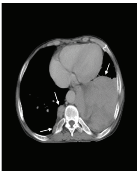
Figure 3. Multiple paraspinal masses in the bottom of the left thoracic cavity were observed in case 2, and the largest measured 10.1x10.5 cm.