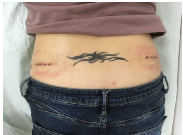
Fig. 2 Wounds after bilateral S3 neurostimulator implantation.

Since the first publication on FS in 1988, it is not clear if FS is an extreme form of dysfunctional voiding with EUS hyperactivity followed by hypotonic bladder or distinct clinical unit. 2 However, every clinician facing unexplained urinary retention in teenage girls and young women should consider