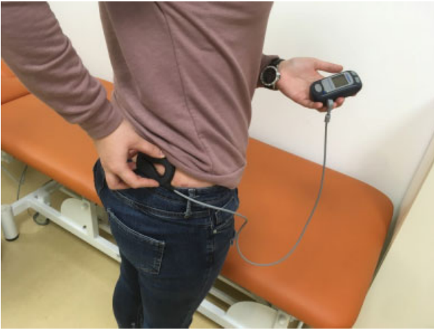
Fig. 3 Transcutaneous remote control of current intensity of the S3 neurostimulators.

this diagnosis as there is a well-known treatment for FS. S3 sacral neuromodulation has a success rate of around 70% of full restoration of spontaneous voiding. 2