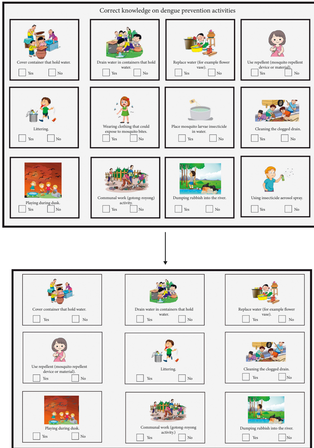
FIGURE 3: Correct knowledge on Dengue prevention activities.