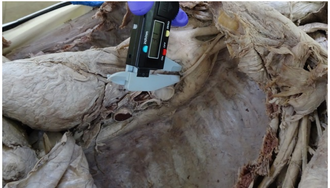
FIGURE 1: Showing the measurement of the left recurrent laryngeal nerve at its origin from the vagus nerve

The angulation between the left vagus nerve and left RLN was measured by a goniometer. The vertical distance between the left RLN and the esophagus was measured at the level of the aortic arch (Figure 2).