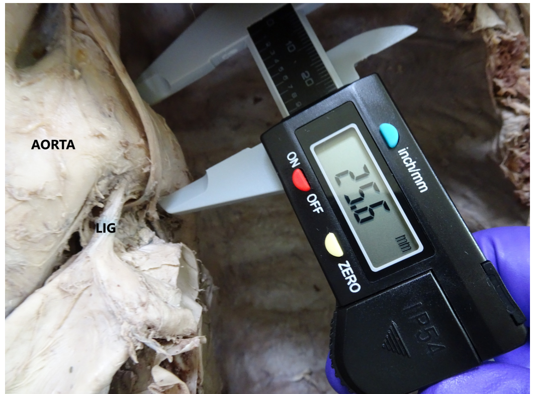
FIGURE 3: Showing the measurement of the diameter of the aortic arch distal to the ligamentum arteriosum (LIG) and vagus nerve

The diameter of the pulmonary artery was measured proximal to its attachment to the ligamentum arteriosum (Figure 4).