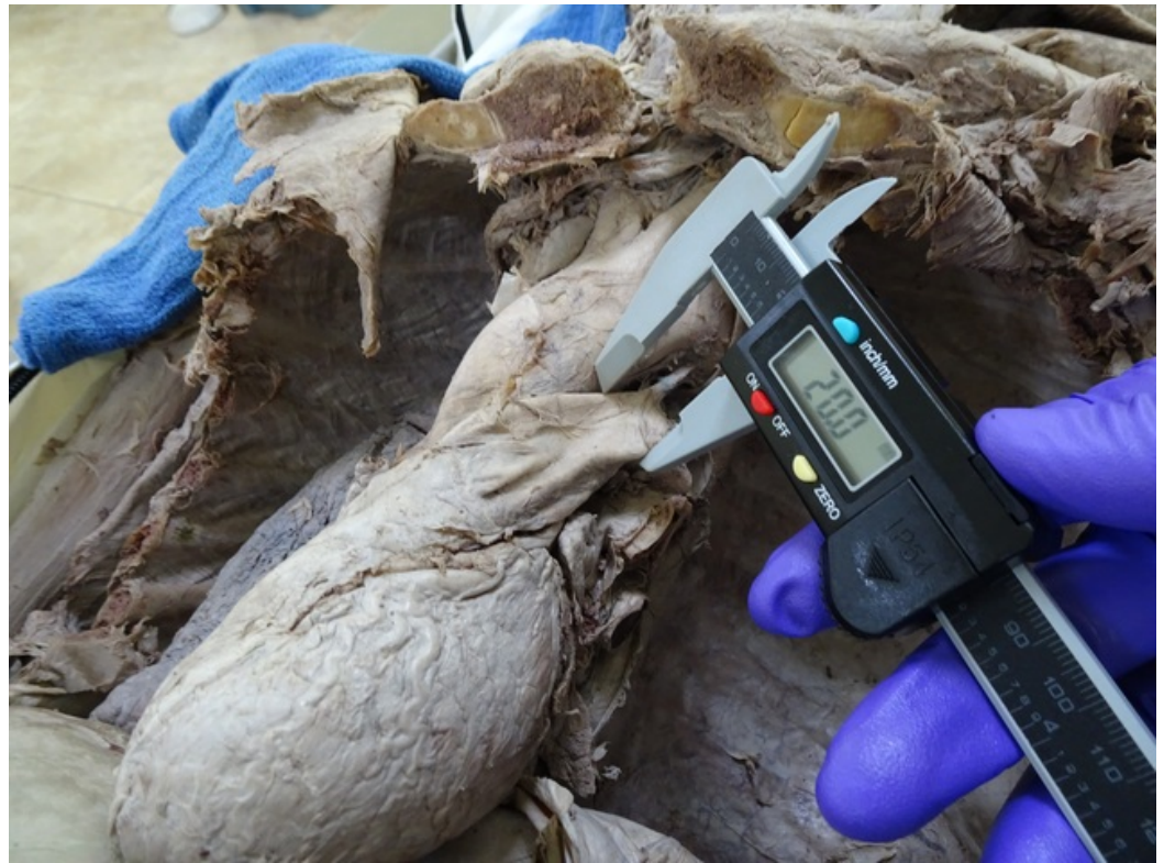
FIGURE 4: Showing the measurement of the pulmonary artery proximal to the attachment of the ligamentum arteriosum

The length of the ligamentum arteriosum was measured between its points of attachments from the undersurface of the aortic arch to the pulmonary artery, and the width of the ligamentum arteriosum was measured roughly at its midpoint (Figure 5).