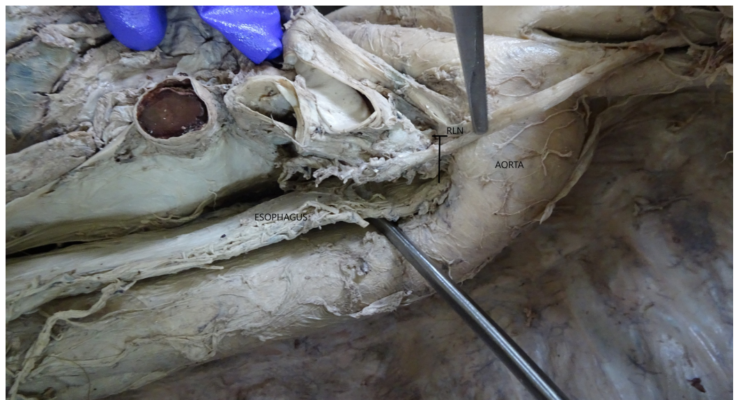
FIGURE 2: Showing the vertical relation between the left recurrent laryngeal nerve (RLN) and esophagus (structure with probe underneath)

The angulation between the left vagus nerve and left RLN was measured by a goniometer. The vertical distance between the left RLN and the esophagus was measured at the level of the aortic arch (Figure 2).