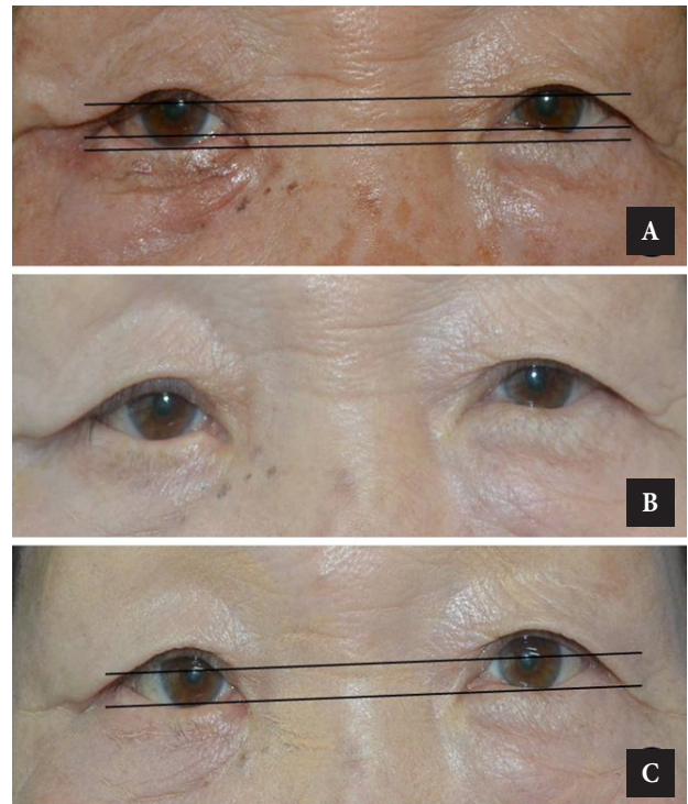
Fig. 3. (A-C) A 72-year-old woman with a right-sided orbitozygomatic fracture, which was treated via the subciliary approach. Photographs from the sequential follow-up visits.

insufficiency), laxity of the lower eyelid (laxity of the lateral canthal tendon or disinsertion), and middle lamellar inflammation and subsequent scarring. The lower eyelid is supported and suspended by the lateral and medial canthal tendons, capsulopalpebral fascia, tarsus, and orbicularis oculi muscles. It is subdivided into the anterior (skin and orbicularis oculi muscle), middle (orbital septum and orbital fat), and posterior (capsulopalpebral fascia and conjunctiva) lamellae. The orbital septum in the lower eyelid has its