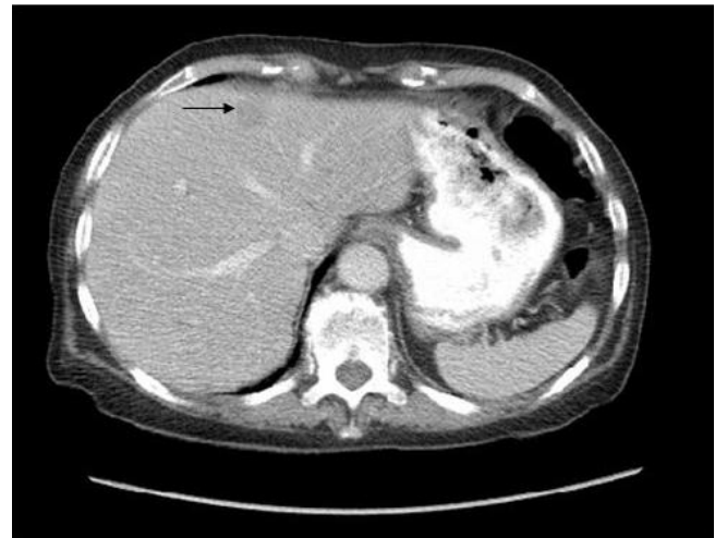
Figure 2 Abdominal CT scan showing liver lesion.