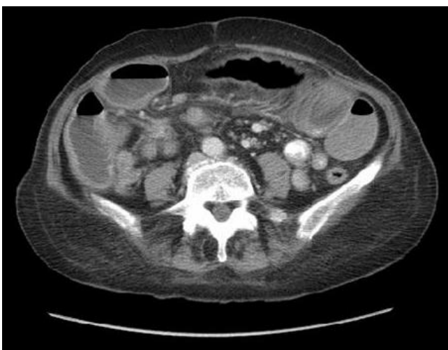
Figure 1 Abdominal CT scan demonstrating dilated loops of bowel, a spiculated lesion in the terminal ileum and mesenteric lymph node enlargement.

At laparotomy the surgical team located the lesion within an ischaemic terminal ileum. They also found significant mesenteric lymphadenopathy. The team carried out a small bowel resection with ileo-caecal anastomosis. At histology the lesion within the terminal ileum was identified as a carcinoid tumour measuring 2 cm, with mesenteric nodal metastasis in the proximal ileum. The patient made a good post-operative recovery and went on for further assessment to identify metastatic disease.